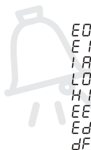
Table of alarms and signals